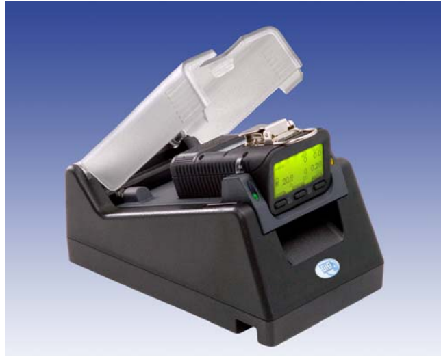
Automatic “docking stations” make calibration and record keeping completely automatic

Most manufacturers now offer automatic calibration or “docking” stations that can automatically calibrate, recharge and store instrument calibration records. The availability – and price point – of automatic calibration stations can have a significant effect on both the usability as well as cost-of-ownership of the instrument over the life of the product. Make sure to find out about the availability – and cost – of calibration and docking stations before rather than after you purchase the equipment.