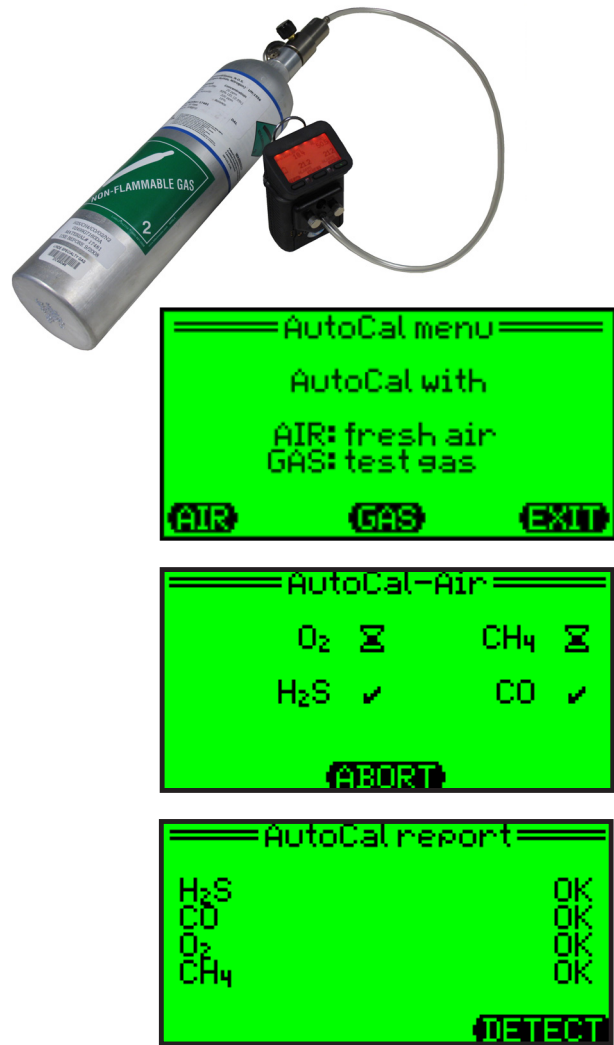
Figure 4: GfG instruments can be automatically fresh air zeroed or calibrated by means of a simple "AutoCal" procedure, (press "Air" to make an automatic fresh air zero adjustment, "Gas" to make a span calibration adjustment, or "Exit" to return to normal operation).

Make sure the instrument is located in fresh air, that the sensors are fully warmed up, and that the readings are stable. Continue to pay attention to the fresh air readings. If readings continue to count downwards it may be necessary to repeat the fresh air zero procedure.