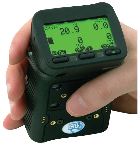
Figure 1: Always allow all of the sensors installed in your instrument to stabilize completely in fresh air BEFORE making a fresh air zero adjustment

GfG does NOT digitally lock LEL or toxic gas readings near zero!