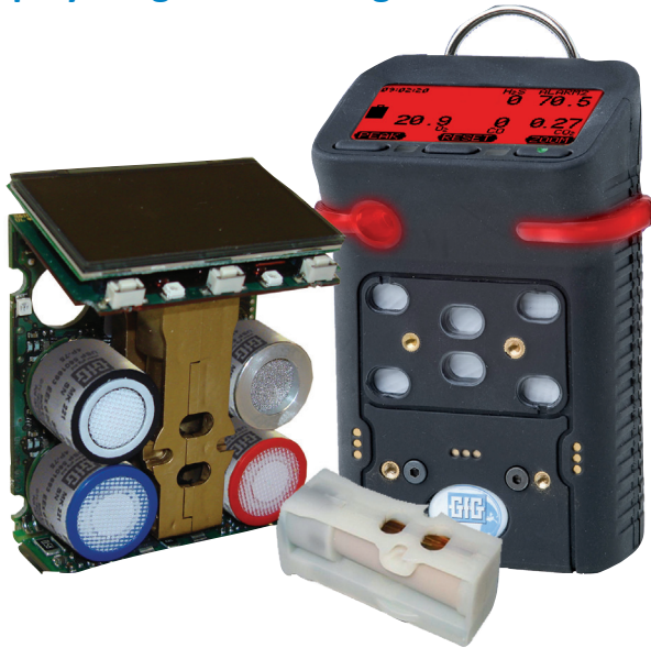
Figure 2: Changes in humidity from one day to the next as well as exposure to certain contaminants can affect the output of gas detecting sensors in fresh air.

Dead-bands may reduce user concerns because of trivial fluctuations in the instrument readings, but they may also leave the user unaware of changes as the instrument initially begins to respond to increasing concentrations of gas. Even worse, when the instrument starts out from a negative output level, it takes that much more gas before the instrument reaches the alarm concentration. For instance, if the LEL alarm is set at 10% LEL, when instrument starts out at -3% LEL it will take 13% LEL gas to cause the instrument to go into alarm. When the display is digitally locked on zero the user is unaware of the need to fresh air zero adjust the instrument.