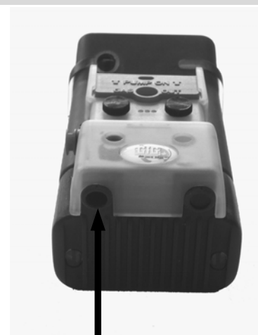
Connection for gas sampling accessories